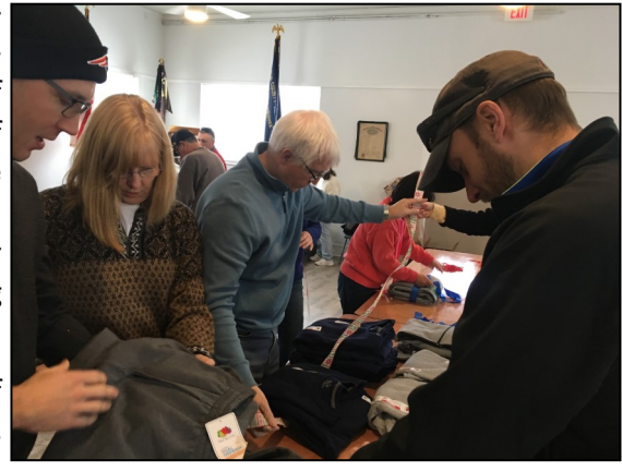
Volunteers sort and pack sweat sets for delivery to Martinsburg VAMC

On January 19th, the boxes of sweats for loaded and on the 20th, they were delivered to the hospital in West Virginia.