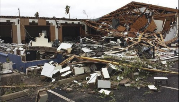
Remains of VFW Post 3904 in Rockport, Texas after Hurricane Harvey passed through the area.

In addition to the monetary support provided by the VFW National, many local VFW members quickly joined relief efforts in their own devastated communities. When members of VFW