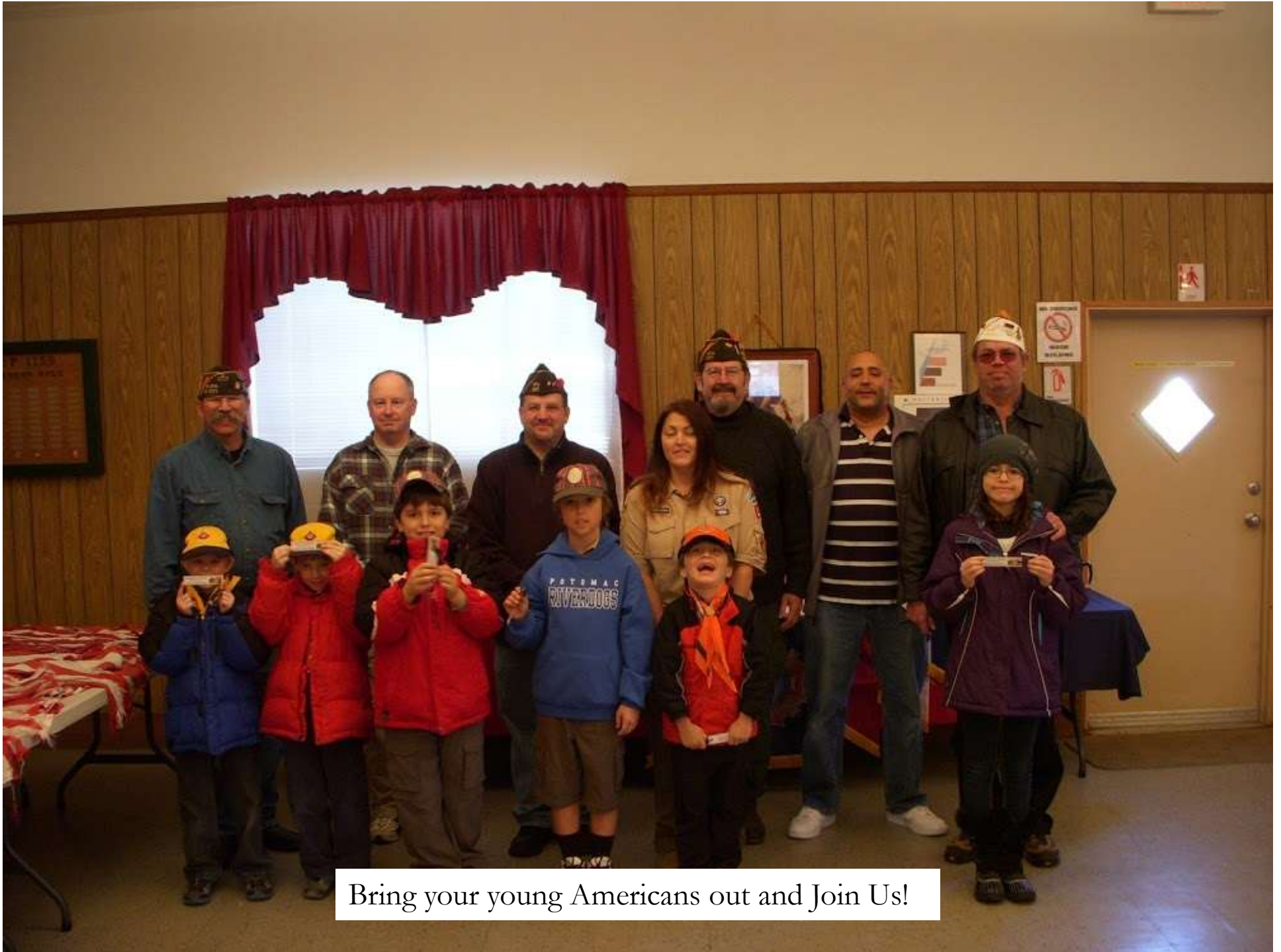
Bring your young Americans out and Join Us!