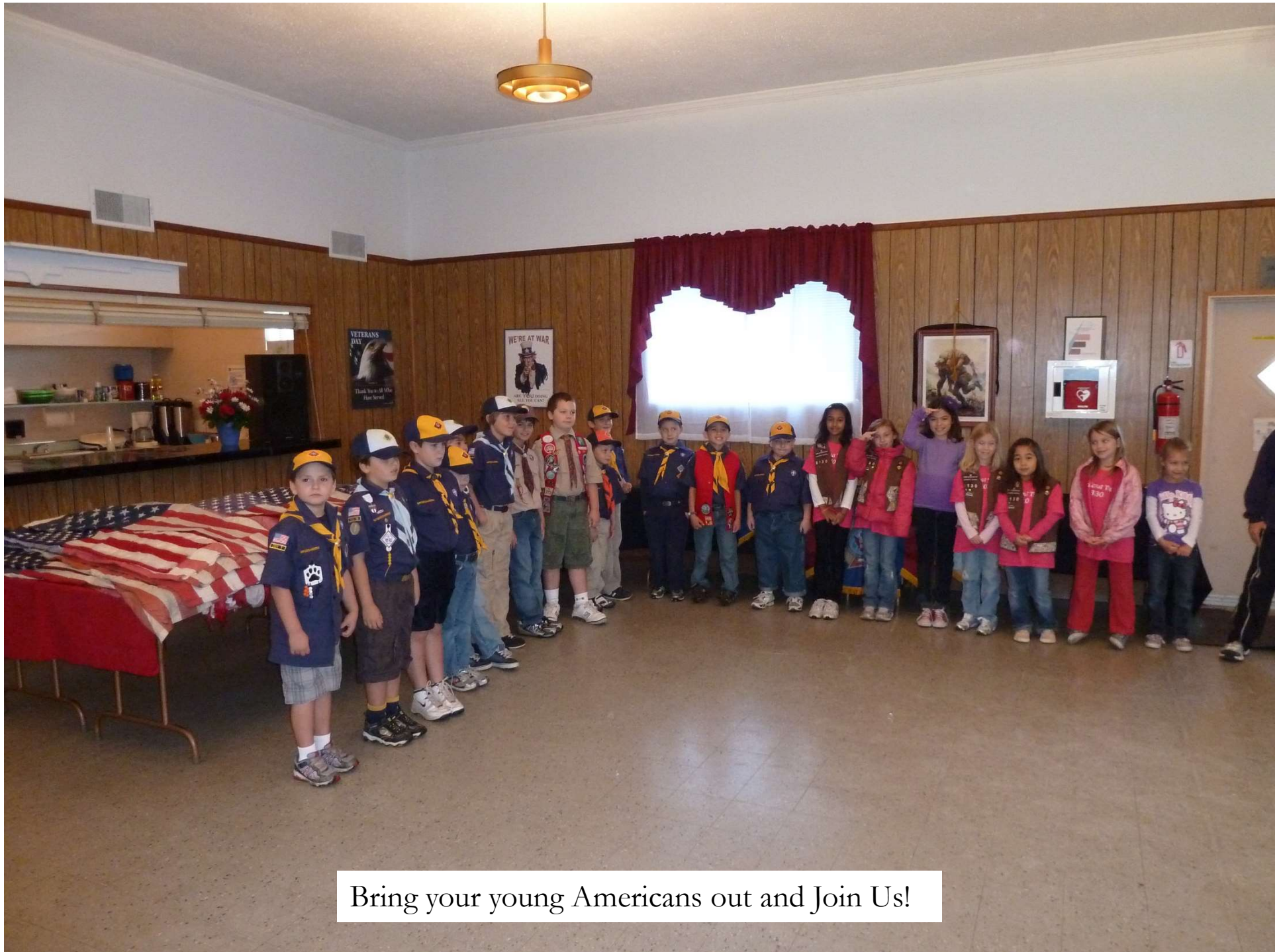
Bring your young Americans out and Join Us!