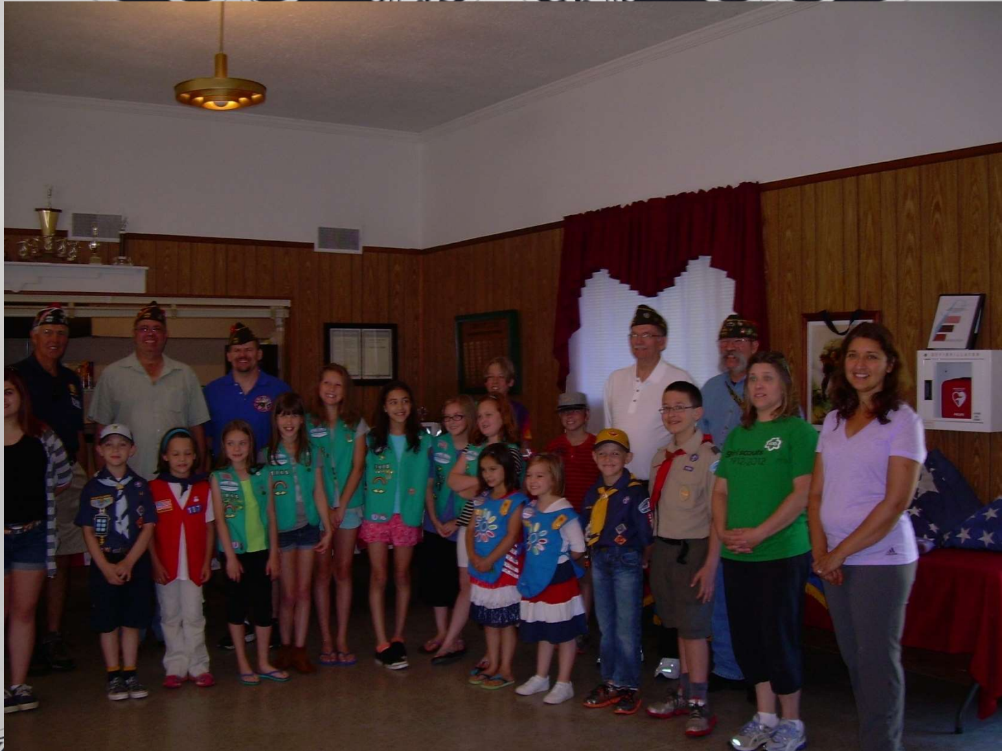
Bring your young Americans out and Join Us!